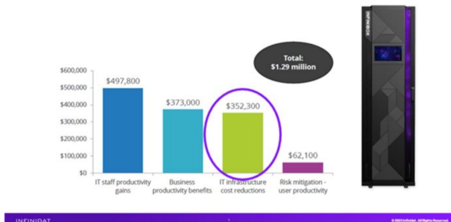
Figure 1: Annual average Benefits per Organization - Business productivity benefits highlighted

In the IDC analysis, there are three main areas that made a huge impact on an enterprise's business value. In this article, we focus on the second biggest one, business productivity benefits, which contributed $373,000 to the overall annual average benefits per organization, of $1.29 million (see figure 1 ).